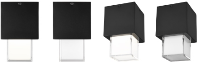
Black (Lit) Black (Unlit) Black Alt (Lit) Black Alt (Unlit)