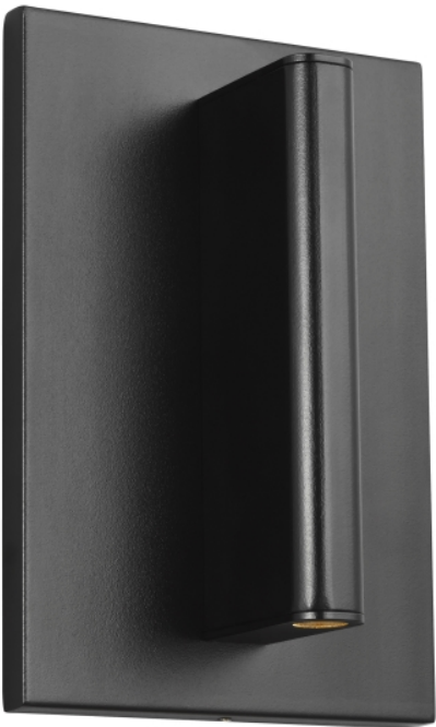
Black 3/4 View