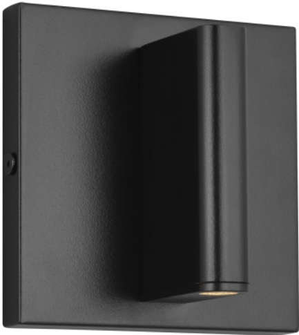
Black 3/4 View