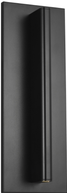
Black 3/4 View