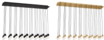
Nightshade Black Natural Brass