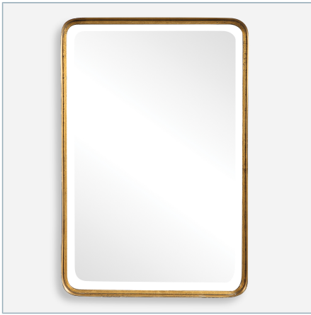
CROFTON VANITY MIRROR, GOLD