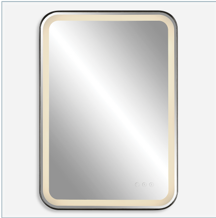
CROFTON LIGHTED VANITY MIRROR, BLACK