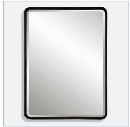
CROFTON LARGE MIRROR, BLACK