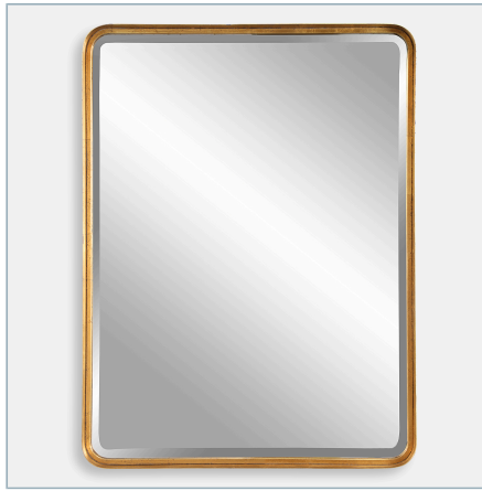
CROFTON LARGE MIRROR, GOLD