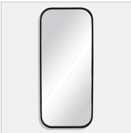
CONCORD TALL MIRROR, BLACK