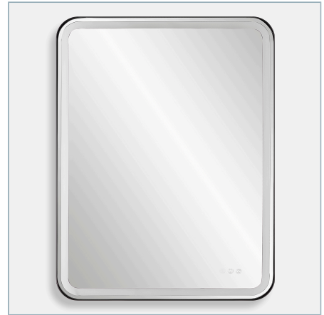
CROFTON LIGHTED LARGE MIRROR, BLACK