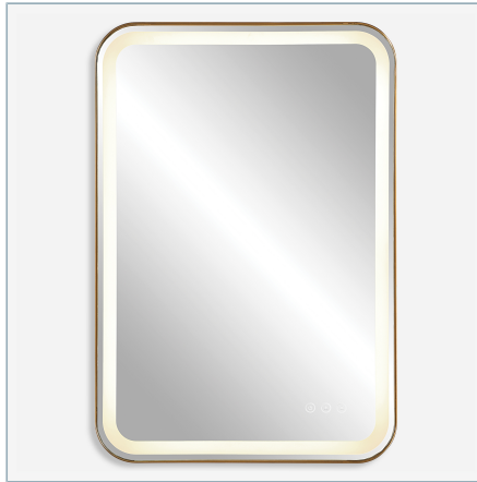
CROFTON LIGHTED VANITY MIRROR, BRASS