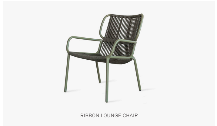
RIBBON LOUNGE CHAIR