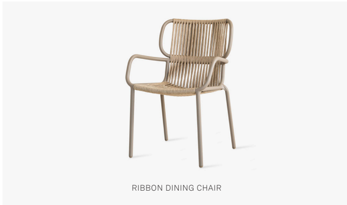
RIBBON DINING CHAIR