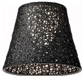
F6298041 Ktribe Floor 3 Outdoor Diffuser Green Wall