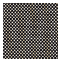
black net cover fabric (optional)